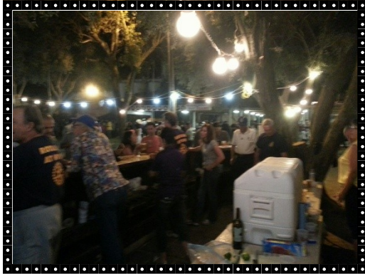
Yolo County Rotarians are kept busy at the beer booth.