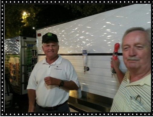
Our Club President works the Beer Booth at the Yolo County Fair.